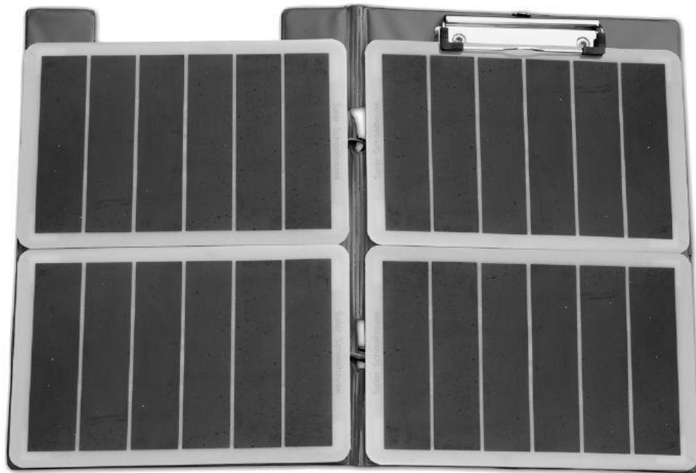
Notebook Solar Array with four - 3 volt, 1 amp solar modules